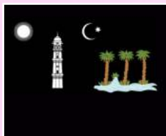
The flag of the Ahmadiyya Muslim Women's Association, known as Lajna Imaillah (the maid servants of Allah)

The Ahmadiyya Muslim Women's Association was established in 1922 by the second successor to the Promised Messiah (peace be on him), His Holiness Hazrat Mirza Bashiruddin Mahmud Ahmad (may Allah be pleased with him). It is an empowered women's organisation whose main goal is to promote religious and secular education amongst women and to support those lacking in these areas and help them in the spirit of sisterhood.