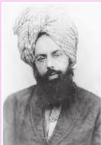
Hazrat Mirza Ghulam Ahmad- The Promised Messiah and Mahdi (peace be on him)

The Ahmadiyya Muslim Community was founded in 1889 by Hazrat Mirza Ghulam Ahmad (1835-1908) of Qadian, India. He claimed to be the expected reformer of the latter days and the awaited one of the world's religions (the Messiah and Mahdi). His mission was to revive the peaceful teachings of Islam and engender in people's hearts the love of God and the duty to serve mankind. The Community is now established in 213 countries and it spearheads a global peace campaign to champion respect and human rights for all.