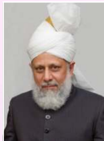
His Holiness, Hazrat Mirza Masroor Ahmad (May Allah be his Helper)

His Holiness Hazrat Mirza Masroor Ahmad (may Allah be his Helper) is the Community's fifth Khalifa. His Holiness encourages the development and progress of women at a time when it is often alleged that Islam does not grant equality between genders. In accordance with the teachings of Islam, he upholds the rights that Islam has given to women and highlights that Ahmadi Muslim women can have true freedom, true enlightenment and true liberty.