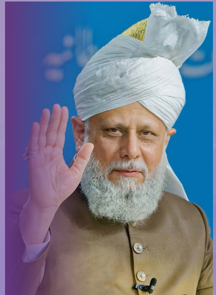
His Holiness Hazrat Mirza Masroor Ahmad (May Allah be his Helper) current worldwide head of the Ahmadiyya Muslim Community

His Holiness Hazrat Mirza Masroor Ahmad (May Allah be his Helper), 'Islam and Europe – A Clash of Civilisations?', Germany, 2020