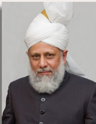
His Holiness Hazrat Mirza Masroor Ahmad