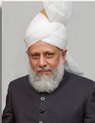
His Holiness Hazrat Mirza Masroor Ahmad