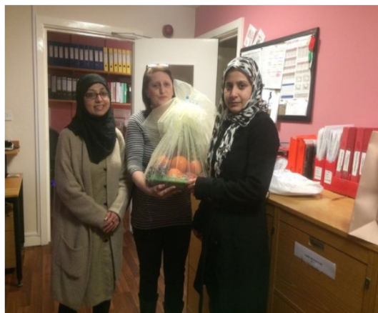
Hampers are handed over at women's shelters by Ahmadiya Muslim Association

Published in the Huddersfield Daily Examiner on 5 April 2016