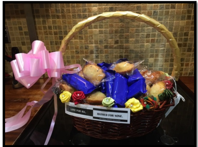
A SMALL SELECTION OF THE 485 HAMPERS PREPARED BY LAJNA