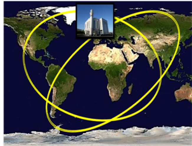
relayed live all across the globe