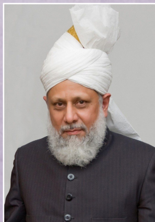
His holiness Hazrat Mirza Masroor Ahmad (may Allah be his helper)- Head of the worldwide Ahmadiyya Muslim Community

His Holiness Hazrat Mirza Masroor Ahmad (may Allah be his helper) is the Community's fifth Khalifa and is based in London. He leads his global Community and inspires it to serve humanity with the spirit of kindness and humility that is integral to Islam. In accordance with the teachings of Islam, he upholds the rights that Islam has given to women and highlights that Ahmadi Muslim women can have true freedom, true enlightenment and true liberty.