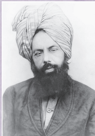
The founder of the Ahmadiyya Muslim Community, Hazrat Mirza Ghulam Ahmad - The Promised Messiah and Mahdi (peace be on him)

His Holiness Hazrat Mirza Masroor Ahmad (may Allah be his helper) is the Community's fifth Khalifa and is based in London. He leads his global Community and inspires it to serve humanity with the spirit of kindness and humility that is integral to Islam. In accordance with the teachings of Islam, he upholds the rights that Islam has given to women and highlights that Ahmadi Muslim women can have true freedom, true enlightenment and true liberty.